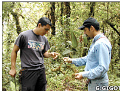
Sites were chosen for their exceptional plant diversity