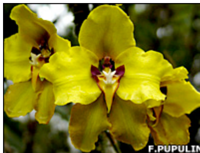
Species of orchid can look the same but be genetically different

A "barcode" gene that can be used to distinguish between the majority of plant species has been identified, say scientists.